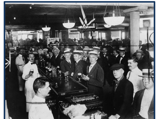
A bar in New York City, the night before prohibition began, 1920