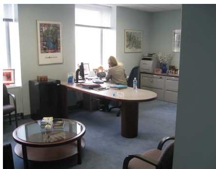
Your GSO General Manager at work

On Friday morning several the Pacific Region delegates caught the train into the City to visit GSO and the Grapevine/La Viña offices at 475 Riverside Drive.